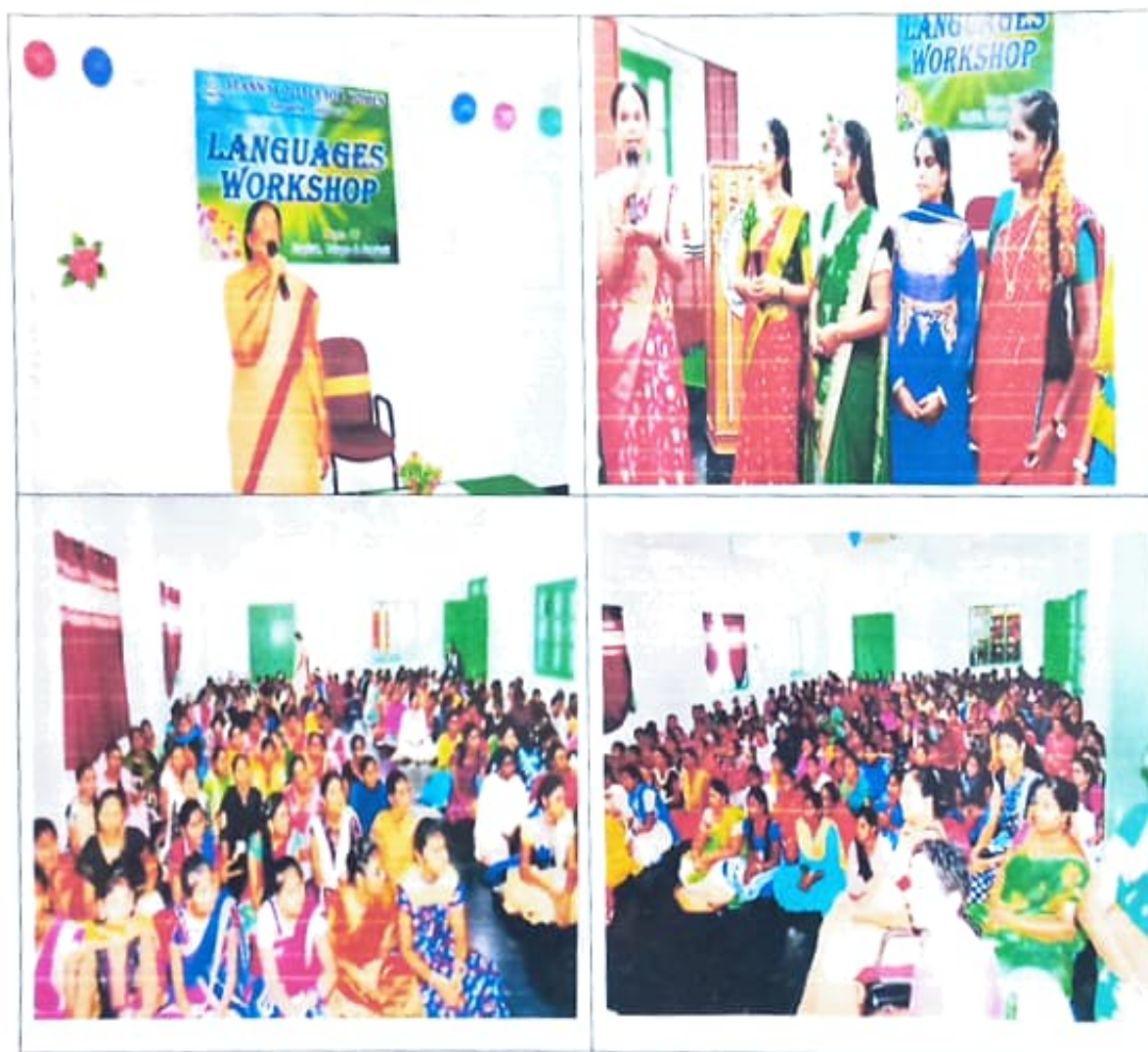
LANGUAGE Workshop (Recitation of Bhagavatam Poems & News Reading Competitions)

The Department of Telugu & Sanskrit conducted language workshop on 5 th February 2020. More than 50 students II nd BSC & B.COM students took part in workshop.